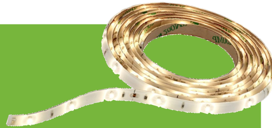
LED Linkable Flexible Strips 12 Diodes - 0.8W - 11.81" 36 Diodes - 2.5W - 39.36"