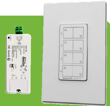
4-Zone Wall Controller Dimming Wi-Fi Receiver