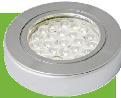
HD LED Surface/Recess Puck 24 Diodes - 1.65W