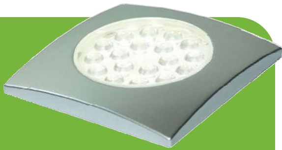
HD LED Square Surface Puck 18 Diodes - 1.25W