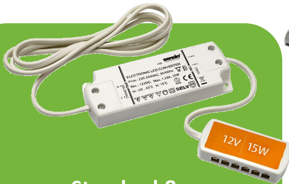
Standard & Dimmable Drivers