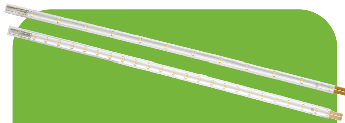
LED Linkable Rigid Strips 12 Diodes - 0.8W - 11.81" 24 Diodes - 1.5W - 11.22"