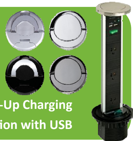
Pop-Up Charging Station with USB